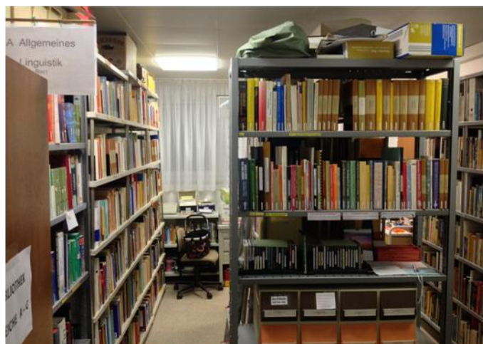
The main room of the library, for now. Katherine's back there, but she likes to hide!