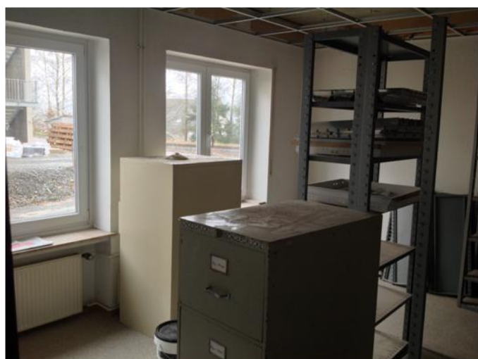
The future library office, part of all the renovation work. A view!