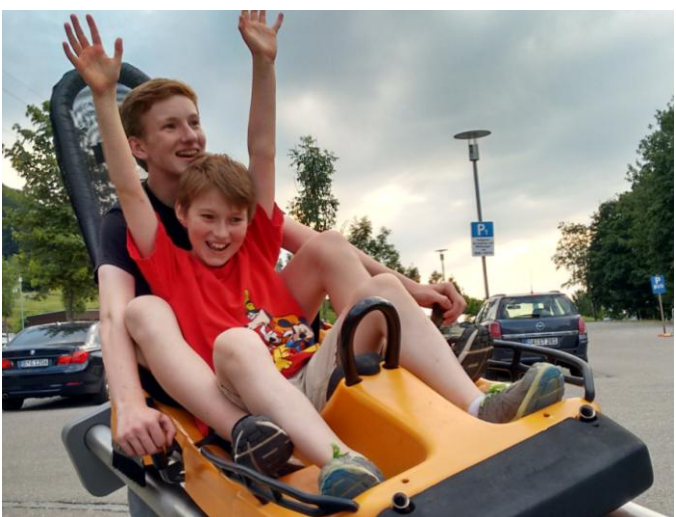
Hamming it up on a model of the Alpsee Coaster on vacation.